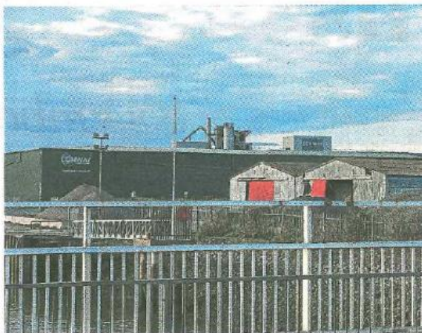
FM Conway in Newhaven found to be in breach of air quality guidelines

"We are working closely with Conway Newhaven and